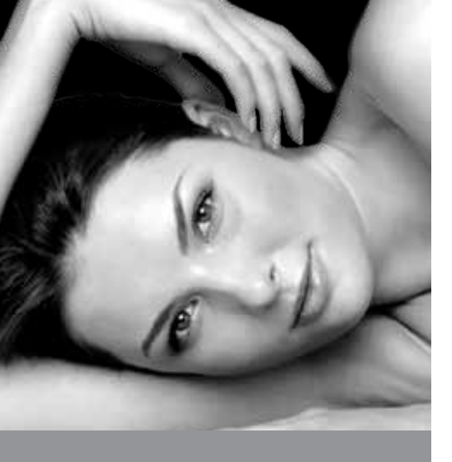
Science. Results. Trust.